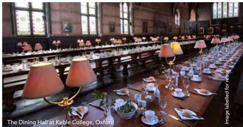
The Dining Hall at Keble College, Oxford

All in all, the learning environment and course content were indeed stimulating and rewarding and the organising committee, faculty and helpers must be commended.