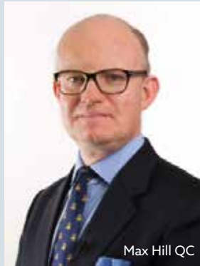
Max Hill QC