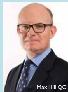
Max Hill QC